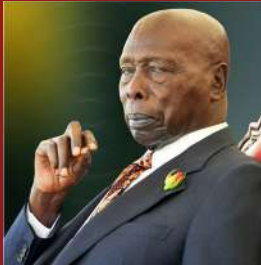
H.E Daniel T. Arap Moi, CGH.

Kabarak University Founder 2 nd President of Kenya